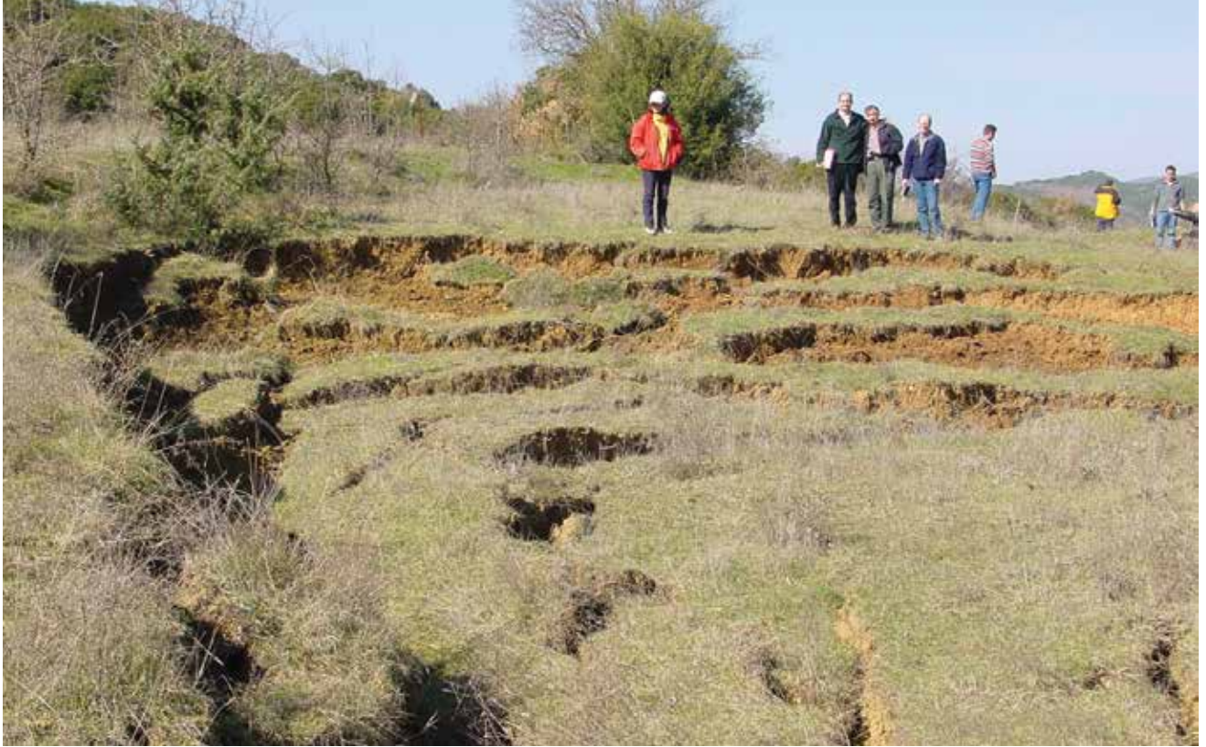
Major landslide in northern Greece on the Egnatia Odos motorway project in 2002. Poulos is third from left.